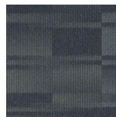
Make A Splash 58460