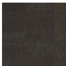
Copper Frost 58760