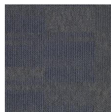
Absolute Blu 58402