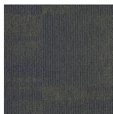
Fused Glass 58315