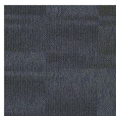
Be Jeweled 58485