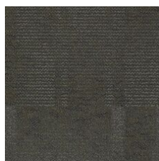
Urban Jungle 58335