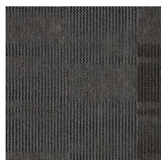
Metal Guru 58595