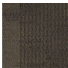
Chocolate Cravi 58761