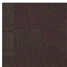
Haute Stuff 58850