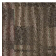
Color My World 58500