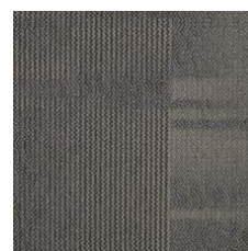
Sheer Magnetic 58585