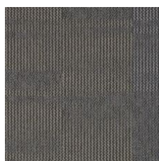
Silver Lining 58530